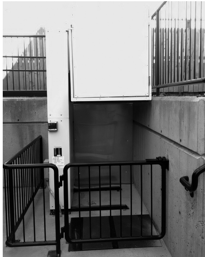
The lift is in and the handrails are installed. The cement base for the engraved bricks will be poured when weather permits, and the bricks installed. We only have 40 bricks left to engrave, so reserve yours now online or by mail in form!

The Bellingham Storytellers Guild returns for another spooky, fun evening of scary stories for Valentine's Day, Saturday, February 13, at the Old Territorial County Courthouse, 1308 E St from 7-8:30 p.m. Tickets will be on sale only at Village Books. $10 for couples, $5 for singles. Don't wait too long to get your tickets as the Halloween shows were sold out.